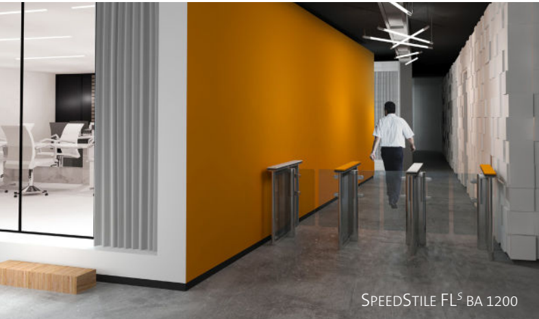
SPEEDSTILE FL S BA 1200