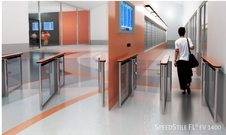
SPEEDSTILE FL S EV 1400