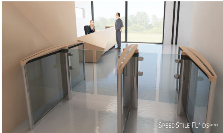
SPEEDSTILE FL S DS series