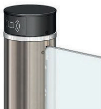
Reader housing installed on GlasStile S

Important: Any horizontal pipe or conduit running below the GlasStile must be at least 140mm below FFL. Metal conduit for cables should be raised at least 50mm from foundation. It is the customer's responsibility to ensure the structural integrity and strength of the installation location. The dimensions given in this Product Data Sheet are for information only. In order to prepare the installation site, please refer to your usual Gunnebo Customer Service contact.